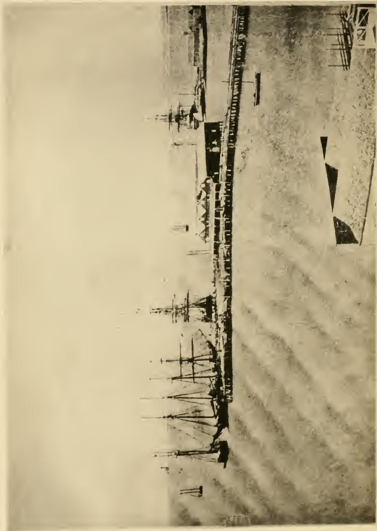
KUHN'S WHARF, GALVESTON, TEXAS.